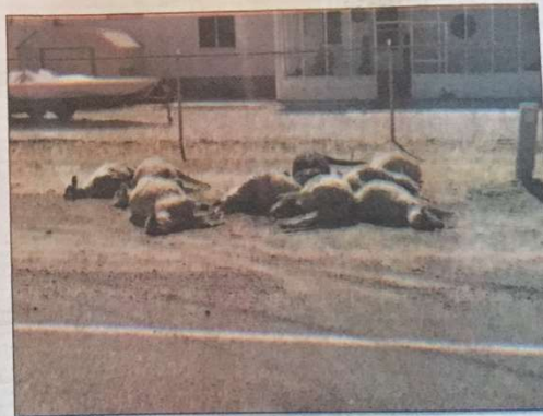
SEVEN SHEEP WERE KILLED and another 10 to 15 were injured Sunday evening when a vehicle plowed into a flock along County 15th Street.