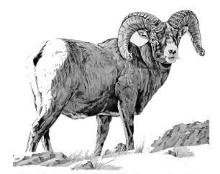
Gallatin Wildlife Association