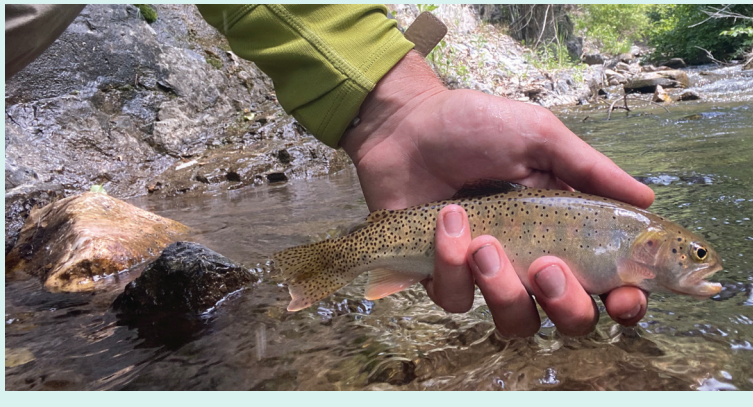
Bonneville Cutthroat Trout, Utah