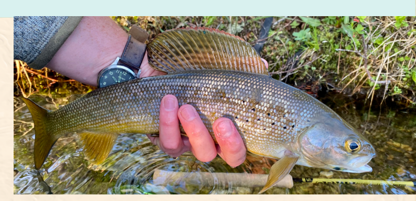
Arctic Grayling, Alaska.

The program celebrates the native trout and char species of the West and invites anglers to catch each species in its native or historic range and is a lifetime challenge for each individual who registers. Participants catch native trout and char in each of 12 western states. WNTI provides education, resources, inspiration, and prizes. The purpose of the Challenge is to strengthen angler awareness of these unique native species, help anglers understand native trout conservation, and grow the community of trout fishing aficionados. As of December 2021, 1,074 anglers have registered for the Western Native Trout Challenge. Residents of California lead the states, followed by Utah, Colorado and Arizona. A total of 179 individuals have completed one or more levels of the Challenge. A number of individuals have completed several of the levels more than once!