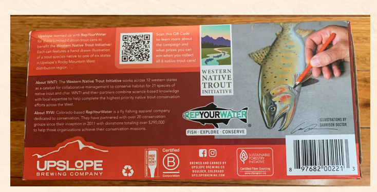
Upslope Brewing Co and RepYourWater