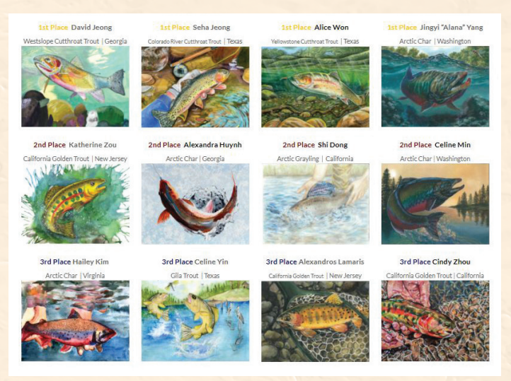
Wildlife Forever State-Fish Art Contest Award Winners

The Wildlife Forever State-Fish Art Contest partnered with WNTI in 2021 to highlight the diversity of native trout in the western United States. This partnership connects youth to the assortment of native trout utilizing the Art of Conservation®. In honor of this collaboration, the Fish Art Contest created a new Western Native Trout Award. Winners were selected in four grade categories, Kindergarten-3rd grade, 4th-6th grade, 7th-9th grade, and 10th-12th grade and awarded a prize package from the Western Native Trout Initiative. wildlifeforever.org western-native-trout-award-winners