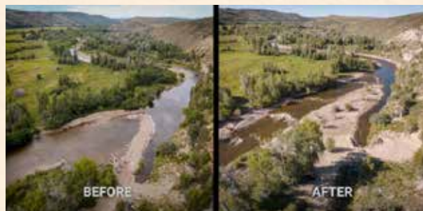
Upper Bear River.